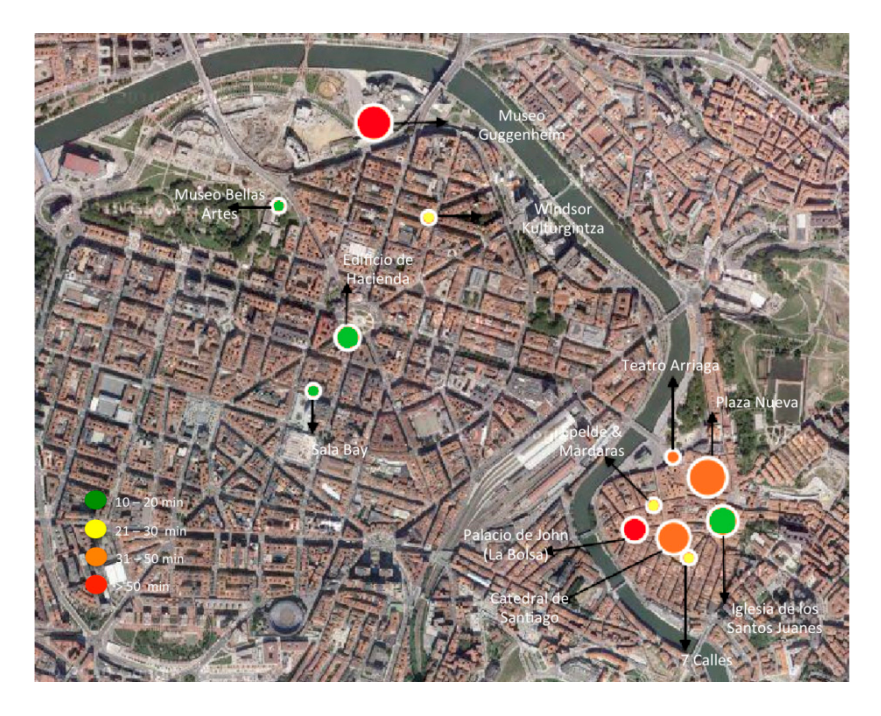
Figure 2. The most visited cultural sites in Bilbao City Centre. CICtourGUNE [50].

In Figure 2, the visits to the cultural resources have been summarized. This is another way to show the time–space consumption. On this map, the most visited cultural sites from Bilbao are represented by a circle. Note that the size of the circles is proportional to the number of visits for each cultural site, and the length of the visits is shown by the color of the circles. As can be seen, the longest visits are related to the Guggenheim museum and the "Palacio de John (Edificio La Bolsa)".