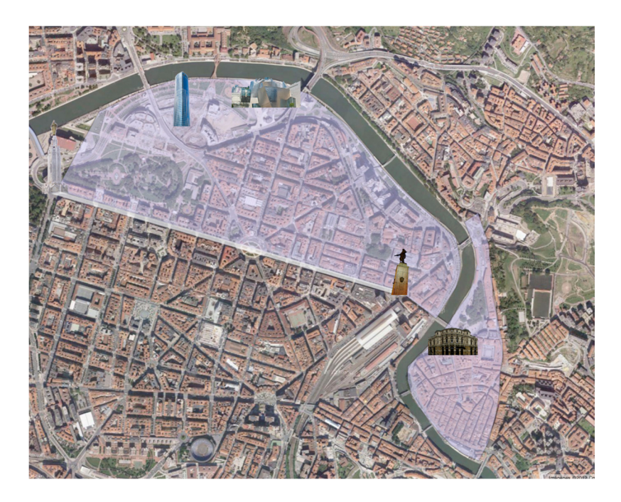
Figure 4. The main Tourism-related Lynch elements in Bilbao: A simple and eligible shape.

The image of the city space perceived from these elements is relatively simple, and it can be represented with a simple shape ("D-shaped"). This implies that Bilbao as a tourist destination has a simple legibility. Furthermore, examining the tourist maps supplied by the Bilbao tourist offices reveals that about 60% of POIs marked on the map belong to the two main areas analyzed: the Old Town and Abandoibarra. Thus, the visitors integrate the spatial elements of the city and the information of the city that they consume, and each visitor generates their own mental map of the city. To extract a general mental map is not easy, but it can be said (as has been seen in Figures 1 and 3) that the mobility of the tourists is closely associated with these spatial elements and with the consumed information, so mobility is somehow related with the mental map of the visitors.