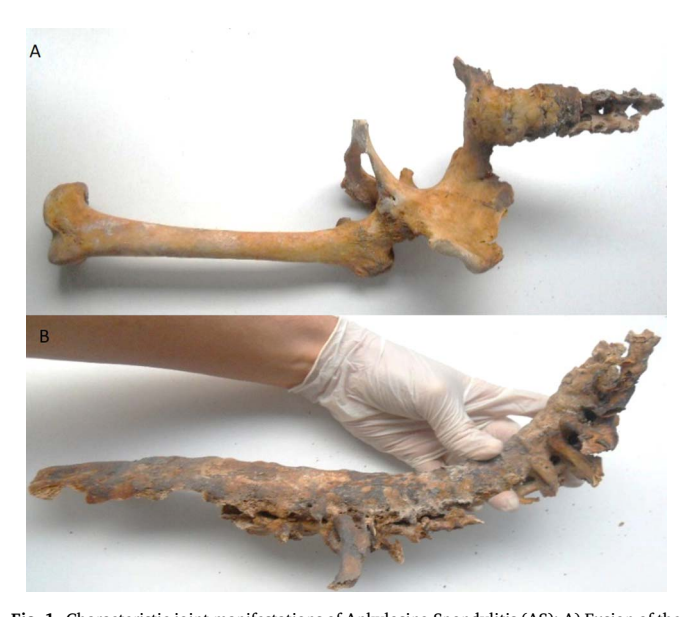
Fig. 1. Characteristic joint manifestations of Ankylosing Spondylitis (AS): A) Fusion of the femur and pelvis, the sacroiliac joint, and the lumbar segment of the spine and B) fusion of the spine with the appearance of a "bamboo spine" (Images courtesy of I.M. Laza).

Ossification begins in the sacroiliac joints and in the lumbar segment of the spine, and from there it moves toward the dorsal and cervical segments (Ebringer and Wilson, 2000) (Fig. 1A). Ossification of the ligaments of the spine joins the intervertebral discs together, resulting in some characteristic bone protuberance in the edges of the vertebral joints known as syndesmophytes. In later stages of the disease, syndesmophytes increase in size, causing the fusion of the vertebrae. In the most severe cases, the spine fuses completely and it acquires the appearance of a bamboo spine (Fig. 1B) (Slaus et al., 2012). It is worth mentioning that, in the case of AS, the growth of new bone tissue affects