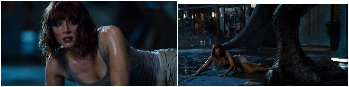
Figs. 3 and 4. Screenshots of a scene in which Claire Dearing lies next to the T-rex, from the film Jurassic World .

Bruised, dirty, disheveled and lying on the ground (see figs. 3 and 4), she could easily remind the viewer of a victim of rape. Yet, she stoically clings to her high heels, which can be both interpreted as a symbol of feminine empowerment, for their association with the business world, and of submission, for the obvious discomfort they cause. On the contrary, Alan, in his button-down and khakis, is never left in such a vulnerable position.