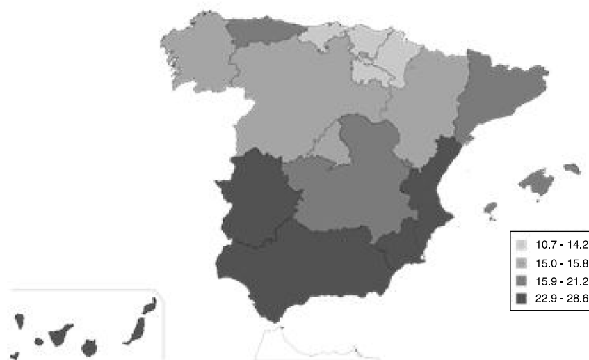
Figure 1. Distribution of unemployment in Spain's autonomous regions according to quartiles of the 2010 unemployment rate. Data source: National Institute of Statistics, Spain.