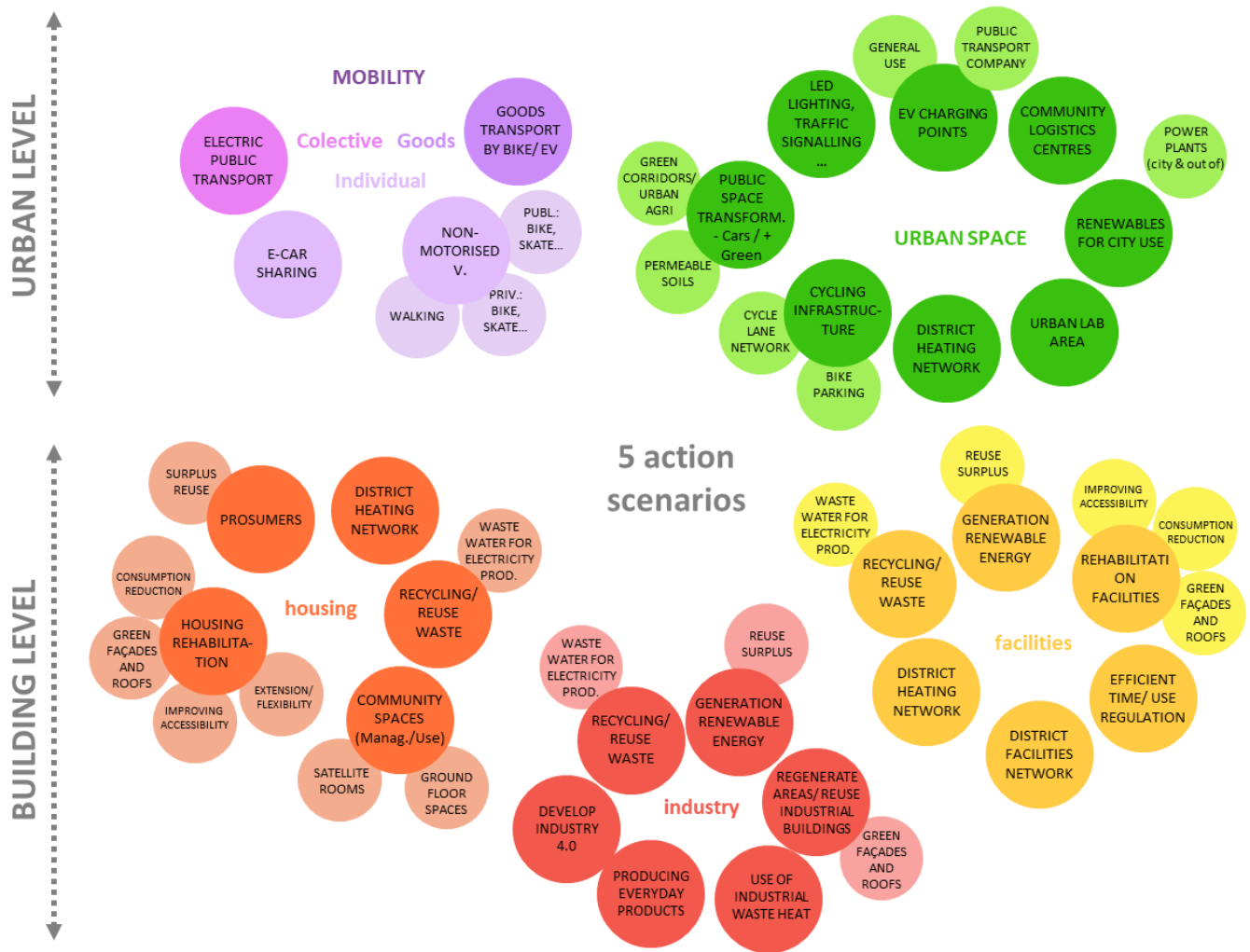
Figure 4. Map identifying strategic action lines.

Based on the study of the urban strategies and policies of these three cities, a cross-analysis of the identified lines of action has been undertaken. To this end, based on the lessons learned from the prospective analysis, the lines of action at the two identified global levels of action have been systematized by means of a conceptual map. In this way, five scenarios for action have been identified (see Figure 4). At an urban level, the lines of action focused on mobility and public spaces, while at the building level, they took into account housing, facilities, and the considerable stock of industrial facilities in the Basque Country.