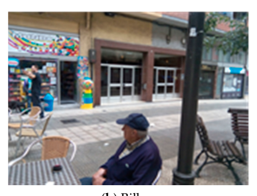
(b) Bilbao "Sweets are a type of product that is widely consumed and demanded by the population. They are consumed by all ages" (Male 68, Uribarri)

"Once a year it doesn't hurt, but daily better not" (Female 36, San Cristóbal) widely consumed and demanded by the population. They are consumed by all