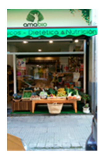
(a) Bilbao "It is more expensive, so there is no universal access" (Female 60, Uribarri)