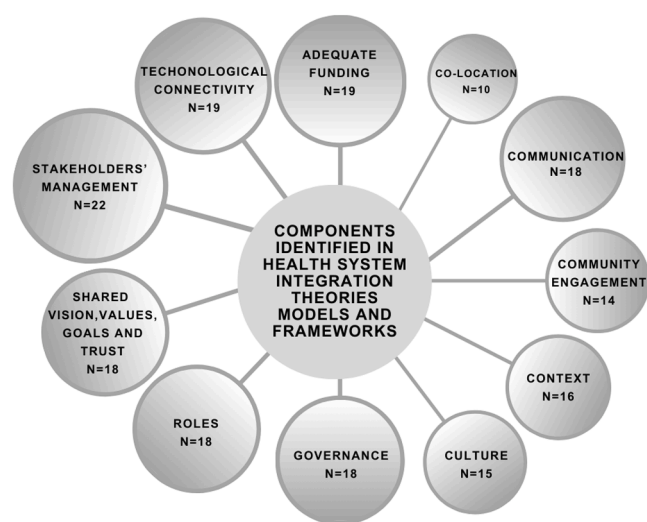
Fig. 2. Bubble plots showing the distribution of components of the theories, models or frameworks of health system integration. Foot note: Each bubble in the figure represents a key component of theories, models or frameworks of health system integration. The size of the bubble is proportional to the number of times the component was identified in studies.

Summary: (✓) component present; (X) component absent.