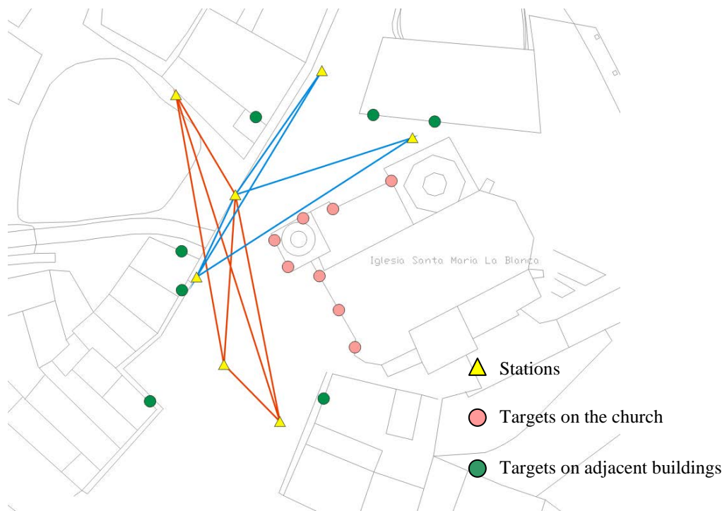
Figure 6: Plan sketch of the layout of the targets and stations.

Although we have measured distances between stations, we have not included them in the preliminary adjustments because we could not take suitable atmospheric data for their precise correction; nevertheless, they were used to obtain the approximate coordinates of the stations.