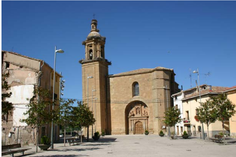
Figure 1: Santa María la Blanca's church and its leaning bell tower

the 17 th century, the side chapels were added during the 18 th century and the bell tower, which is the main subject of this study, started to be built in 1794 (Moya Valgañón, 1975). This source does not mention any of the currently visible pathologies: the west façade (in which the door is embedded) presents many cracks of considerable size and the tower that joints it on the north appears noticeably detached with a leaning of about 2 degrees; in spite of this, consulted neighbours say that they have always known the tower in that way; however, they disagree whether they have noticed an increase in the number or size of the cracks and the leaning of the tower.