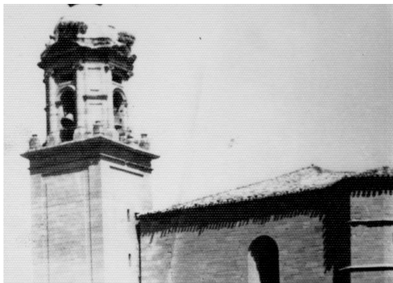
Figure 2: Photograph of the 60's (full and detail) where the detachment and crack are already noticeable.