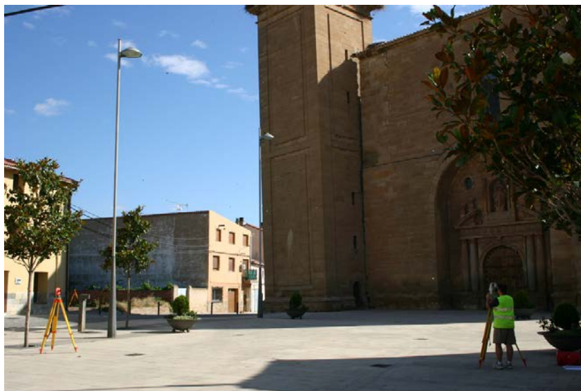
Figure 7: Set up of the surveying field work

Each target is observed from three different references, following the well-know sequence DP_{reference}-DP_{target}-RP_{target}-RP_{reference} (DP: direct position, RP: reverse position). The configuration was designed so that each target is observed from at least three stations.