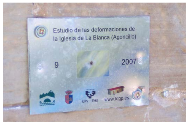
Figure 4: Plate with information about the project and nail (bottom right).

Several doubts arose when determining the most suitable sort of target for the observation, in the end, we decided to use two alternatives and analyse which one behaves better: the first one is a set of plates of stainless steel (100 x 70 mm) with its number carved and an adhesive stick with all the information about the project, the observation point is a hole of 1 mm diameter in the middle. During the campaign, these targets permit an easy location and identification, nevertheless, the central point does not always have a clear definition. On the other hand, we have embedded stainless steel nails of 5 mm diameter with a cross engraved on their head; these nails were placed near the plates. Generally, pointing at the nail is more accurate than pointing at the plate; nonetheless, they would be rather difficult to locate without the plates. Anyhow, before we can state which kind of target is more appropriate we have to see how time will affect them.