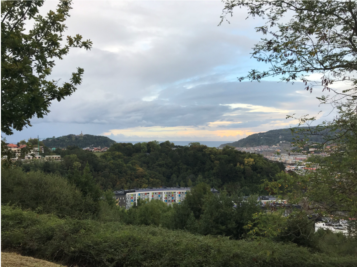
Figure 2. Overview of the Arbaizenea woods. At the base of the wooded hill, the Morlans neighborhood. On the summit and to the right, the Arbaizenea mansion; center summit, the Txanpuene caserío and the slope down to the Txanpuene spring and the lavoir at Arbaizenea. On the summit and to left, the Ayete neighborhood. At the bottom right, the Amara neighborhood and the Urumea river.