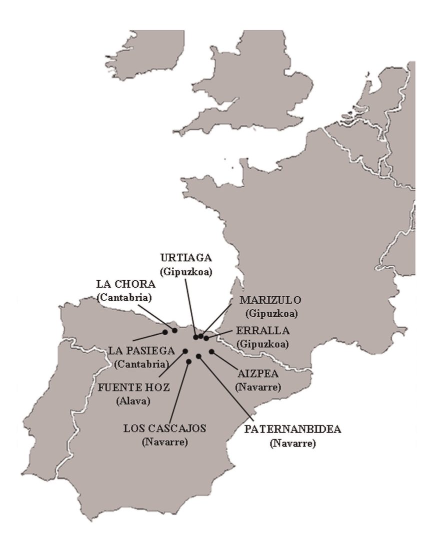
Figure 1. Geographic location of the ancient human remains analysed in the present study. All sites are located in the North of the Iberian Peninsula. doi:10.1371/journal.pone.0034417.q001

Near East towards Europe contributed to the genetic composition of present-day populations. Nevertheless, based on modern European patterns of mitochondrial diversity, Richards et al. [9] argued that this mitochondrial diversity had a predominantly Paleolithic origin, with a small Neolithic contribution (12%), which would favour the cultural diffusion model. Subsequent studies applying new methodologies have allowed quantifying the contribution of Neolithic farmers to the genetic pool of presentday European populations at 23% [12,13].