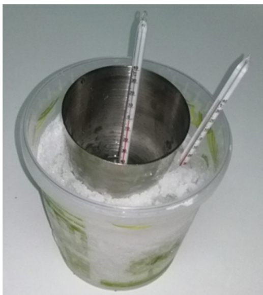
Image 2 Placement of the thermometers in the cooling bath.

solution remained liquid. Accordingly, 44.5 ml of water was collected following the melting process of the frozen fraction of the sample.