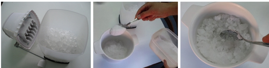
Image 1 Procedure to prepare the cooling bath.