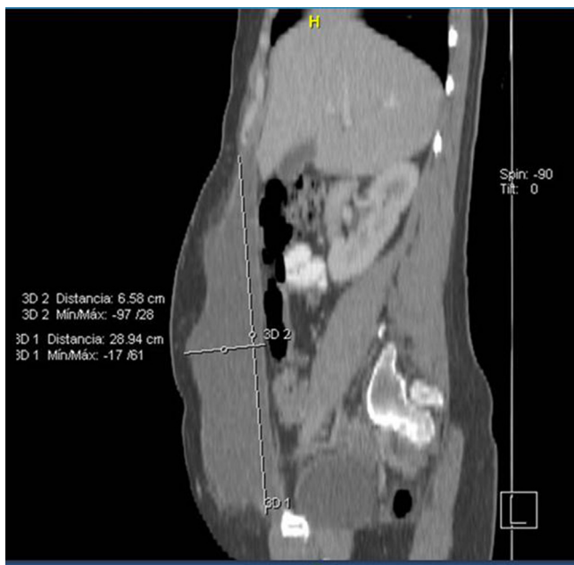
Fig. 1. Computed tomography revealed a 1-l periprosthetic seroma.

mimicking metastatic disease during the follow-up of a previously metastatic melanoma patient treated in the University Hospital of Araba is presented.