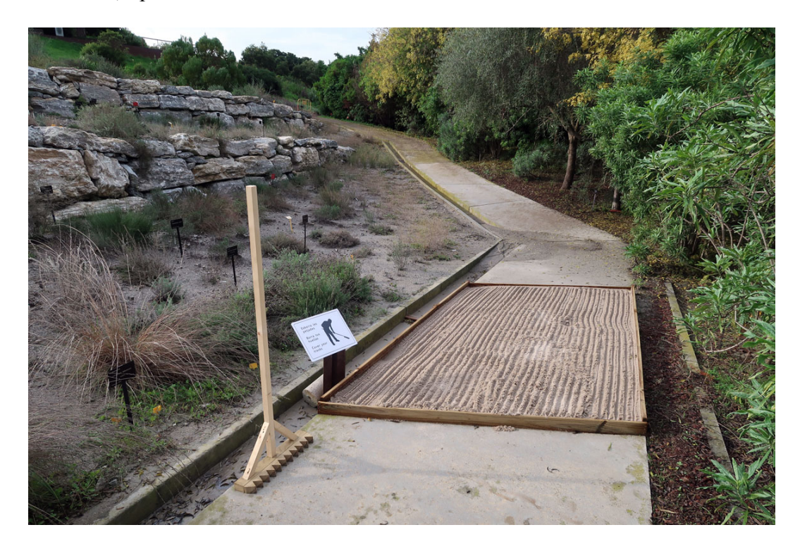
Image 8: Robert Waters, Cover Your Tracks (Installation 2, Visitor Raking), 2018, Jardí Botànic de Barcelona, Spain.

Image 7: Robert Waters, Cover Your Tracks (Installation 2), 2018, Jardí Botànic de Barcelona, Spain.