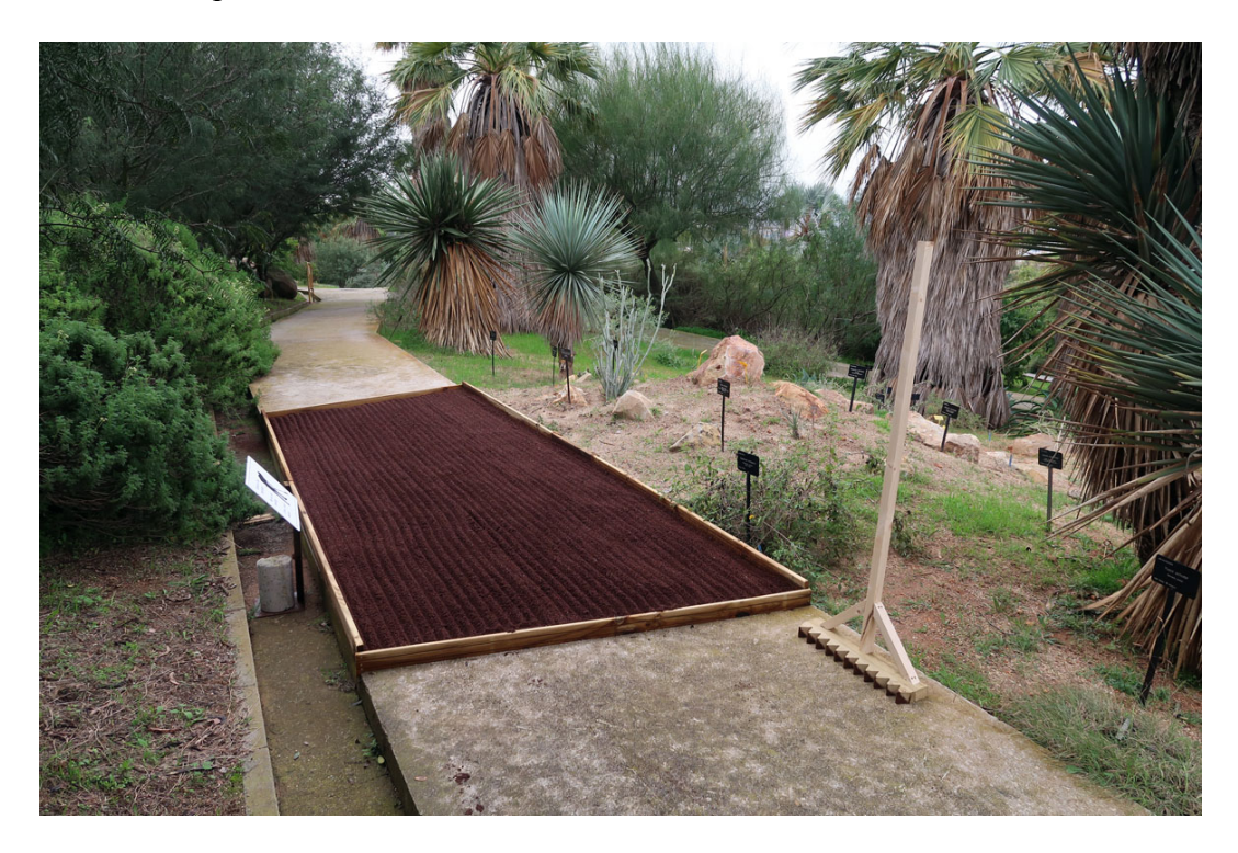
Image 10: Robert Waters, Cover Your Tracks (Installation 3, Visitor Walking), 2018, Jardí Botànic de Barcelona, Spain.

Image 9: Robert Waters, Cover Your Tracks (Installation 3), 2018, Jardí Botànic de Barcelona, Spain.