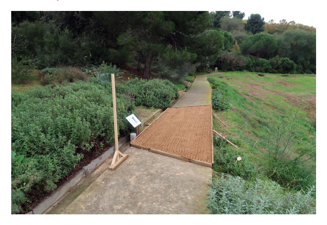
Image 6: Robert Waters, Cover Your Tracks (Installation 1, Group Visit), 2018, Jardí Botànic de Barcelona, Spain.

Image 5: Robert Waters, Cover Your Tracks (Installation 1), 2018, Jardí Botànic de Barcelona, Spain.