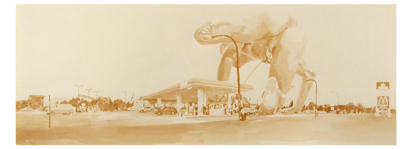
Image 1: Robert Waters, Getting Back to Nature 3 . 2005, drawing with urine, balsamic vinegar and motor oil on paper, 28 x 76 cm. Private collection.

When I made this series, I was concerned about the idea of nature being something that we had to drive to and I wanted to eliminate the perceived separation between humanity, our culture and nature. While the political message is obvious through what this series represents visually, it is fortified by a second layer of meaning that is hidden within its materials; urine, balsamic vinegar and motor oil. I wanted to reference the expression "piss and vinegar" with these unconventional materials, to connote an aggressive or rebellious energy.<sup>775</sup> Combined with the motor oil, I sought to stimulate an added jolt of disgust, humour and understanding to anyone who was curious enough to read the information tag hanging next to the series. I wanted to provide the opportunity for viewers to look again at the images with a new understanding, one that was different from their first impression. While the traditional nature of my images makes them visually accessible, the conceptual leanings of my projects rely on knowledge that a viewer might or might not have, which largely depends on their personal context. While the expression "piss and vinegar" is quite common to English speakers, this reference would certainly be lost on Spanish speakers. As such, it is an artistic gamble to refer