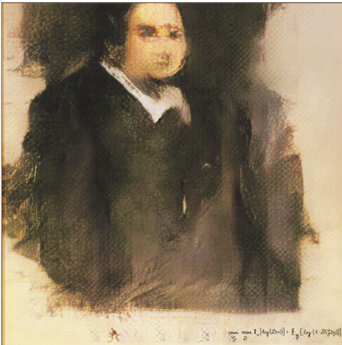
Edmond de Belamy painting. Download here (Public Domain): https://en.wikipedia.org/wiki/Edmond_de_Belamy#/media/ File:Edmond_de_Belamy.png

There is no doubt that in this case Computational Aesthetics help us improve understanding of human aesthetic perception. Because when intelligent machines start generating their own designs and art pieces, free from our aesthetic constraints, how are we as human beings going to be able to understand their own original outcomes? Are we ready to adapt and fall in love with non-anthropocentric forms of creativity?