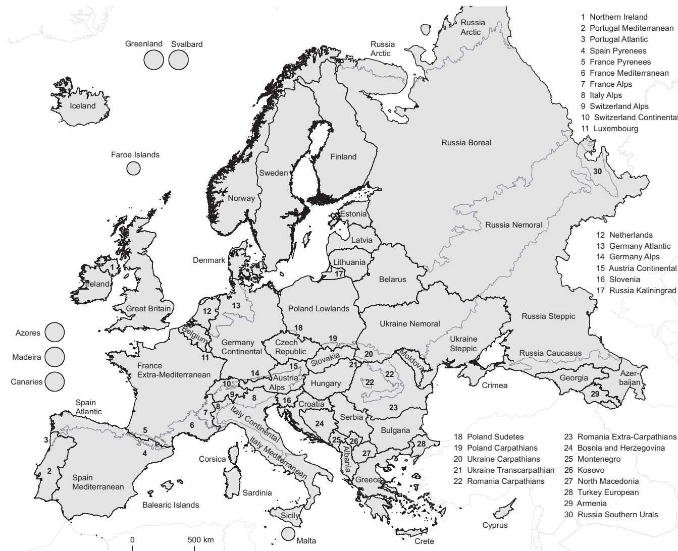
FIGURE 1 Territorial units used for distribution mapping of European alliances. These units are based on countries. Some islands, archipelagos and peninsulas are mapped separately. The mainland parts of some countries are subdivided based on the borders between European biogeographical regions. The Azores, Madeira, the Canary Islands, Greenland and Svalbard are shown as circles at the edges of the map. The Faroe Islands and Malta are shown as circles at their actual position

Kalníková et al., 2021). We took special care to correctly interpret the names and concepts of each alliance to match those of the EuroVegChecklist. We encountered several alliances that were either newly described or newly recorded in Europe since publication of the EuroVegChecklist. However, we did not map them in this study. They can be added to the current set of maps after being evaluated and accepted by the European Vegetation Classification Committee ( http://euroveg.org/evc-committee ; Biurrun & Willner, 2020). In the third step, we produced preliminary distribution maps and involved a larger group of vegetation and habitat experts from most European countries to revise and complement these maps.