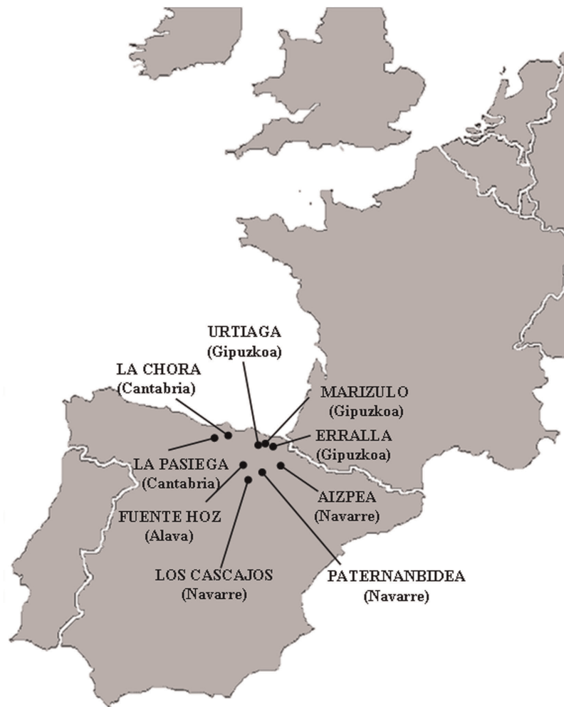
Figure 1. Geographic location of the ancient human remains analysed in the present study. All sites are located in the North of the Iberian Peninsula.